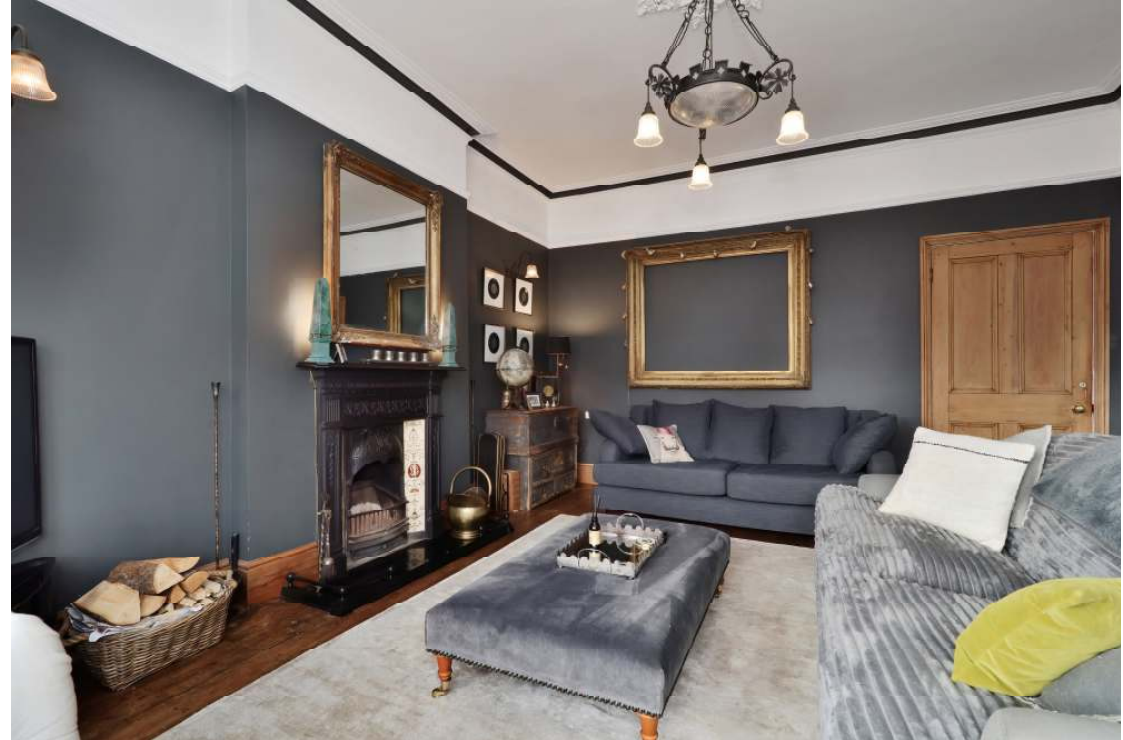
Drawing room / dining room and kitchen/breakfast room overlooking the gardens