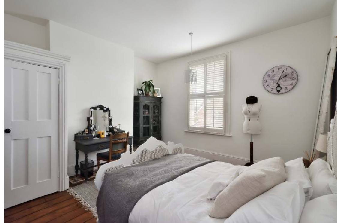
Three further bedrooms with a supporting bathroom